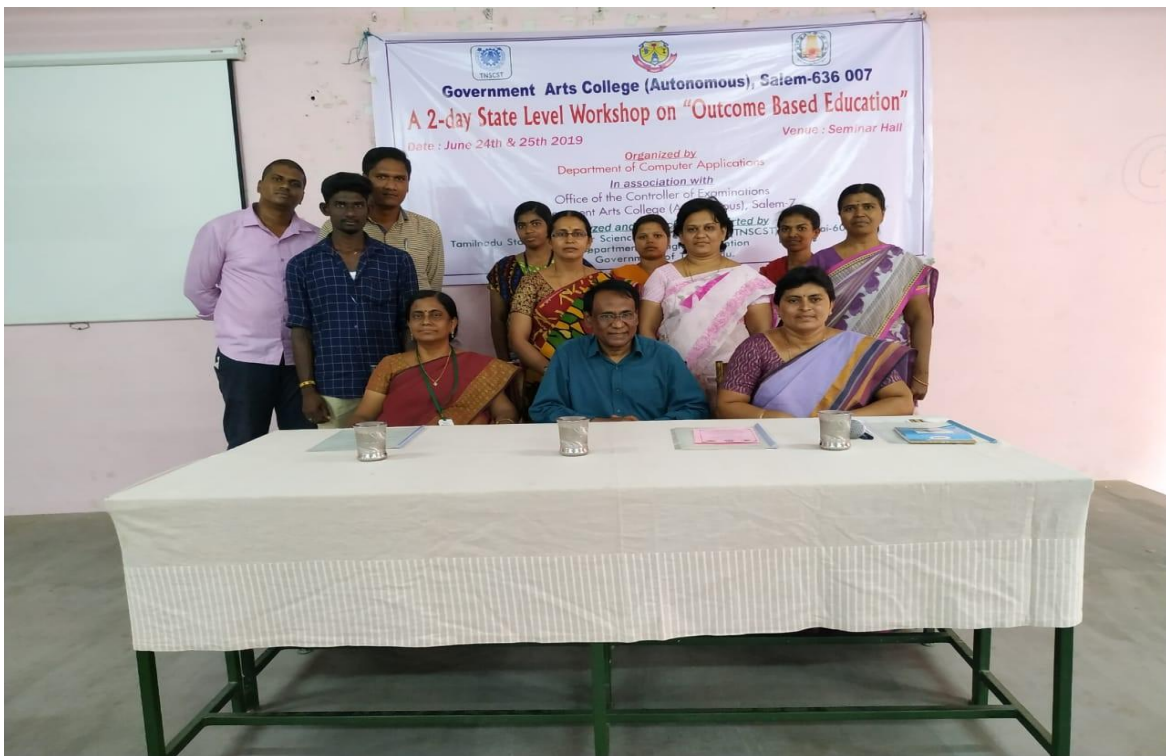
The organizing team with Resource Person and Convener

The research scholars and the final PG students along with the faculty members were involved in organizing this two days workshop.