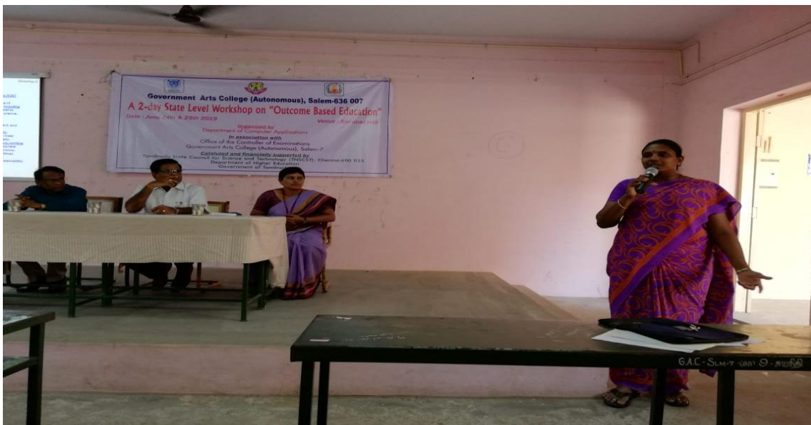
A participant from Vivekanandha College of Arts and Science for Women (Autonomous) giving Feedback on the Workshop during Valedictory Function