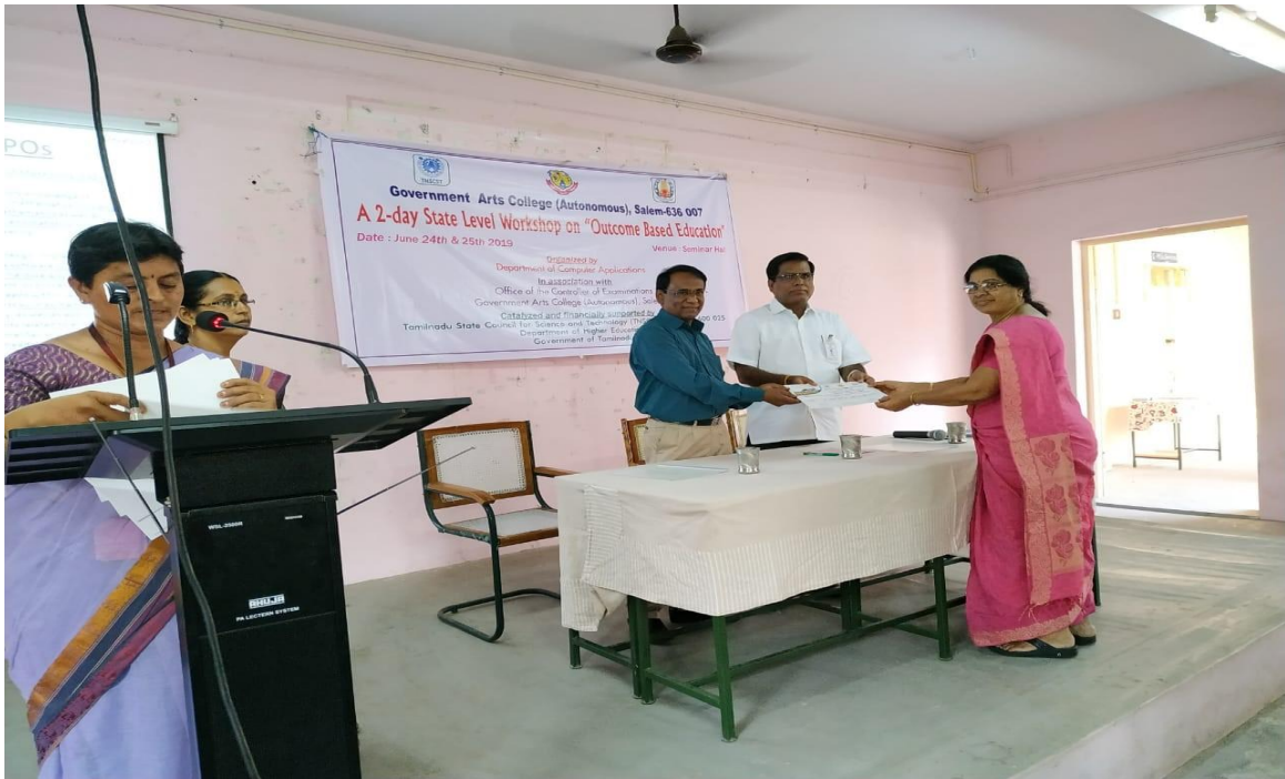
A participant from Sri Saradha College for Women(Autonomous) receiving the certificate Participants from outside colleges are mostly from Autonomous institutions.